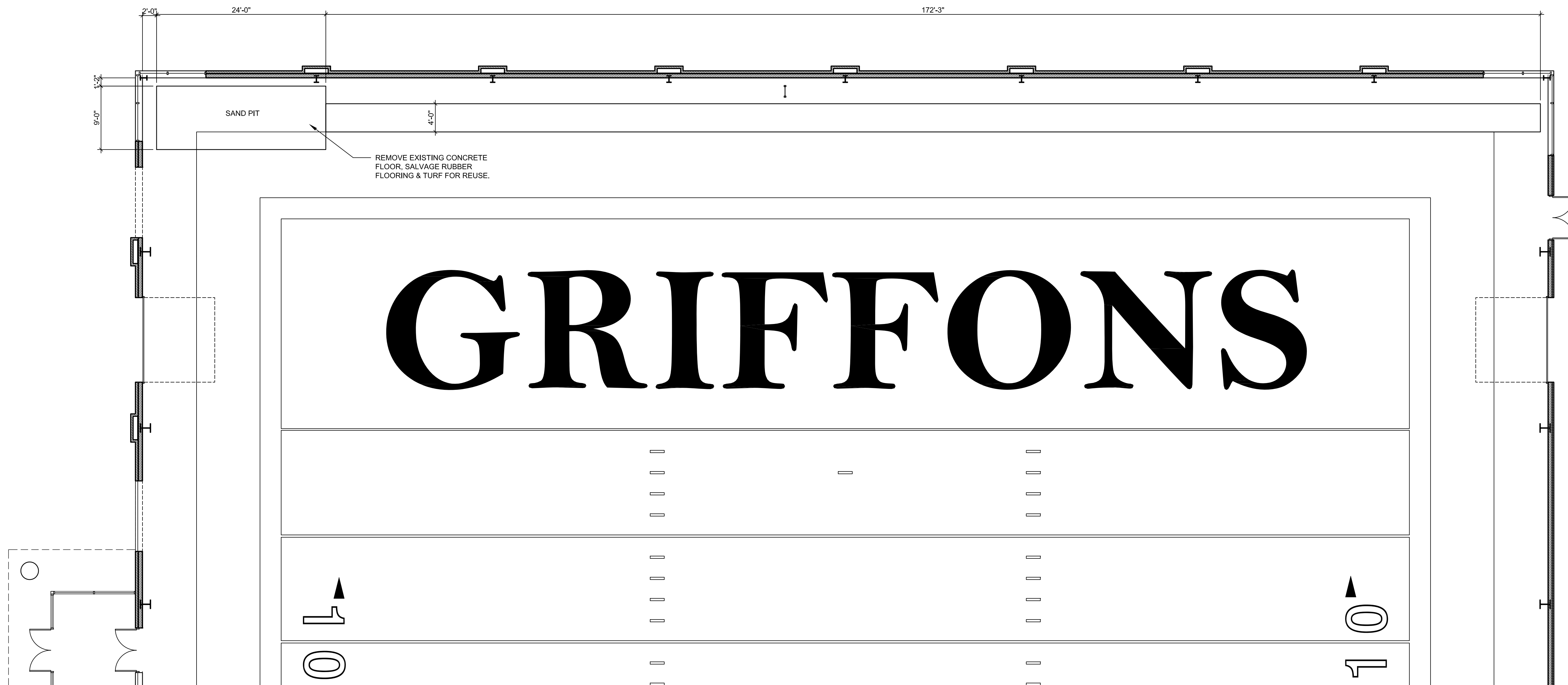
1 COMPOSITE FLOOR PLAN SCALE: 1" = 20'-0"