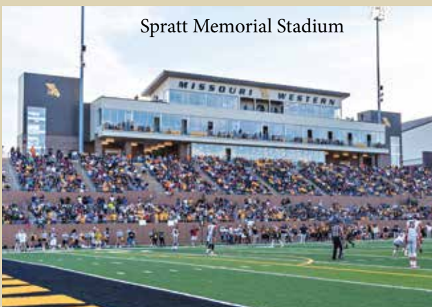
Spratt Memorial Stadium