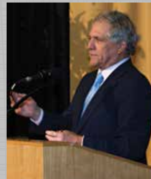
Leslie Moonves, president and CEO of CBS Corporation, speaks at the dedication ceremony of Phase III of the Walter Cronkite Memorial.