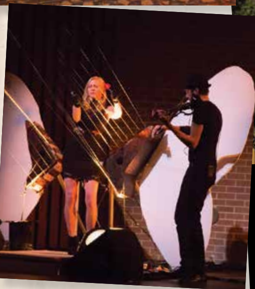
Top, students enjoy their Centennial ball. Bottom, an earth harp and violin performance was part of the Centennial Capital Campaign kickoff in January 2015.