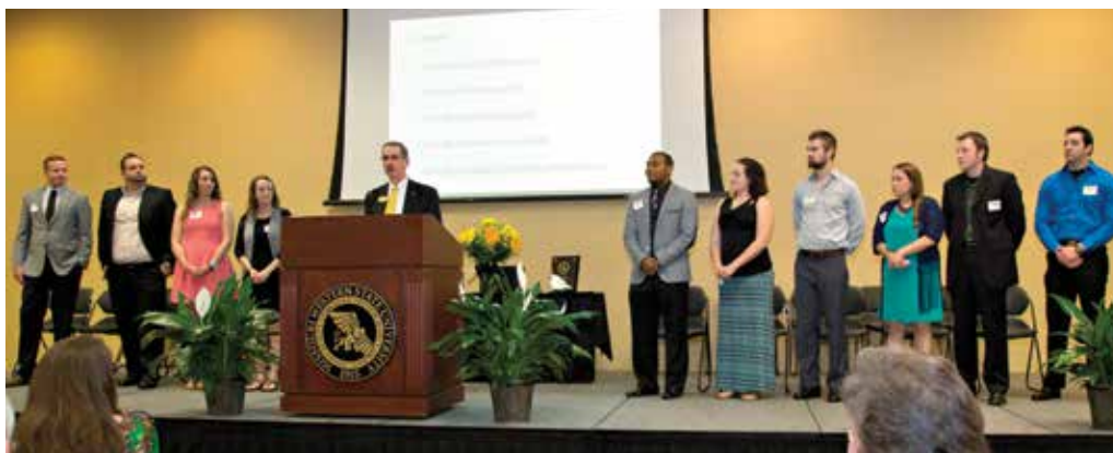
Craig School of Business entrepreneurs take the stage at the annual entrepreneur dinner on campus.