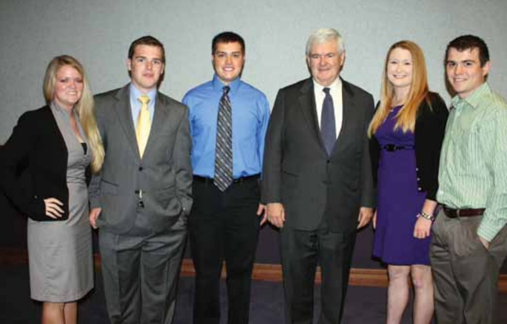
Newt Gingrich poses for a photo with the MWSU College Republicans.