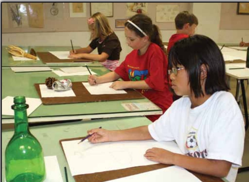
The Western Institute's Center for Community Arts once again held the annual Artscape, a weeklong hands-on arts camp for children. This year, 173 participated.