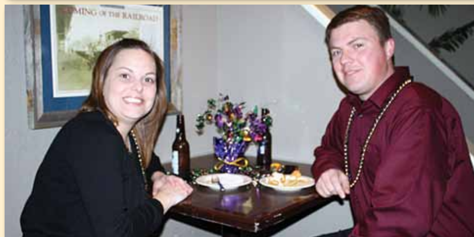
The St. Joseph chapter of the Alumni Association hosted its annual Mardi Gras party at Boudreaux's Louisiana Seafood and Steaks in February.