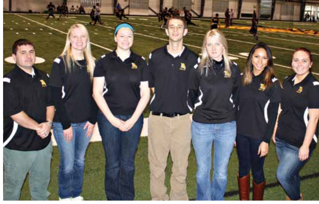
Members of the American Corrections Association student group help at the Missouri Division of Youth Services' football tournament in the Griffon Indoor Sports Complex on campus.

The group re-organized in the spring of 2013 and last fall, students