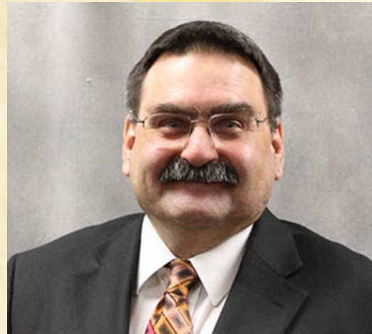
James Mulder Library