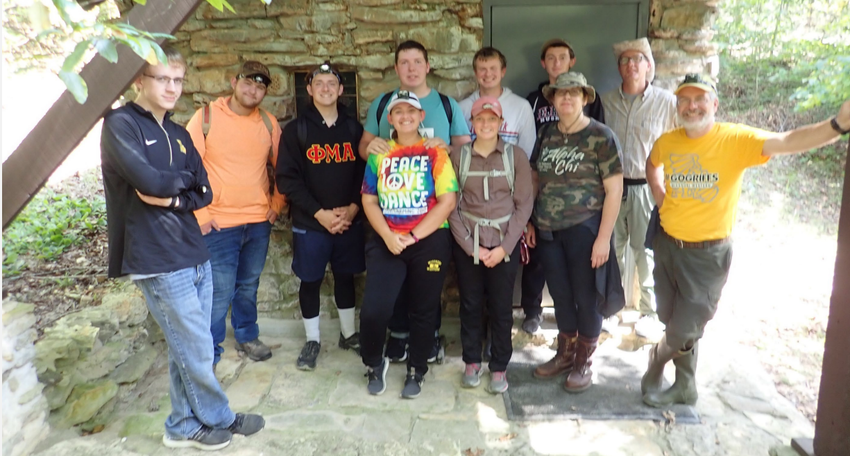
2019 Colloquium Retreat to the Ozark Underground Laboratory