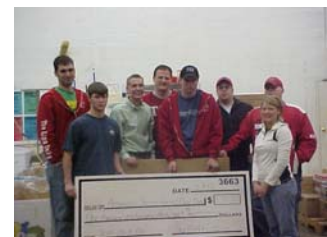
Members of the Chapter present a $1132 check to the Food Bank for this year’s Teke in a Box efforts.

➤ Extracurricular Involvement & Achievement ➤ Initiation Rates ➤ Alumni Involvement & Relations Congratulations to the men of the Chapter once again for their continued success in 2005!