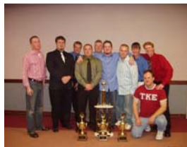
TKE brothers proudly display this year’s various awards.

Although this time the change won’t come through sweat, toil, and backbreaking work, TKE alumni have been working for the last few months to raise the necessary money to supplement the campus change. The total landscaping project will cost a little over $900, and alumni wanting to still be part of the Western legacy have given back to help the association with this project, which the original Chapter members started back when their alma mater