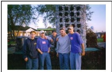
TKE Brothers at Homecoming 1999 in front of their finished and well-pomped float – the Chapter placed 2 nd this year.

fire led to the Chapter's sudden departure from campus in 1983. Quickly, the Chapter was disbanded from Tau Kappa Epsilon Intl. Fraternity after a short-term suspension and there was no talk of re-opening right away or even ever again.